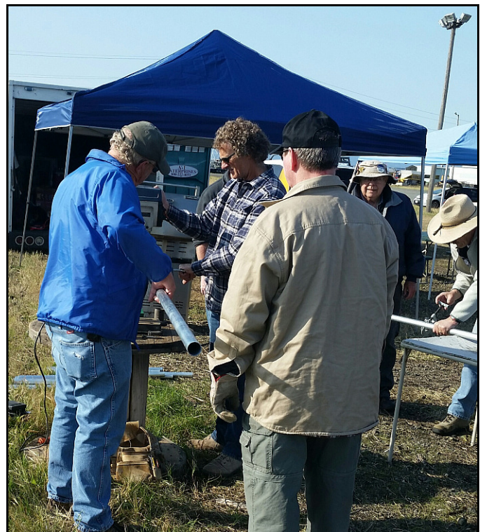
Repairing the Shades (see minutes).